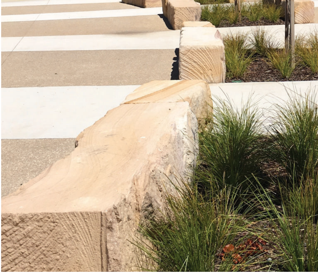
Sandstone bench seating