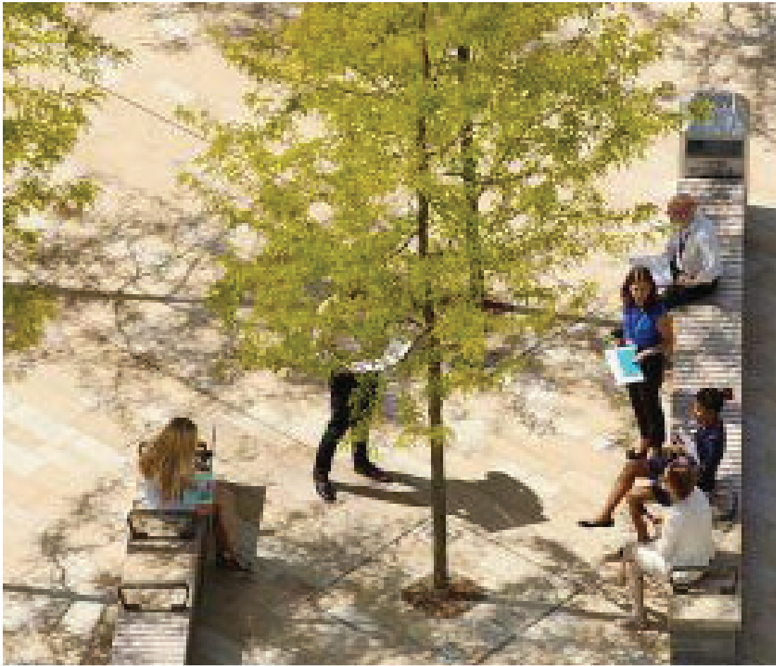
Seating under tree canopy