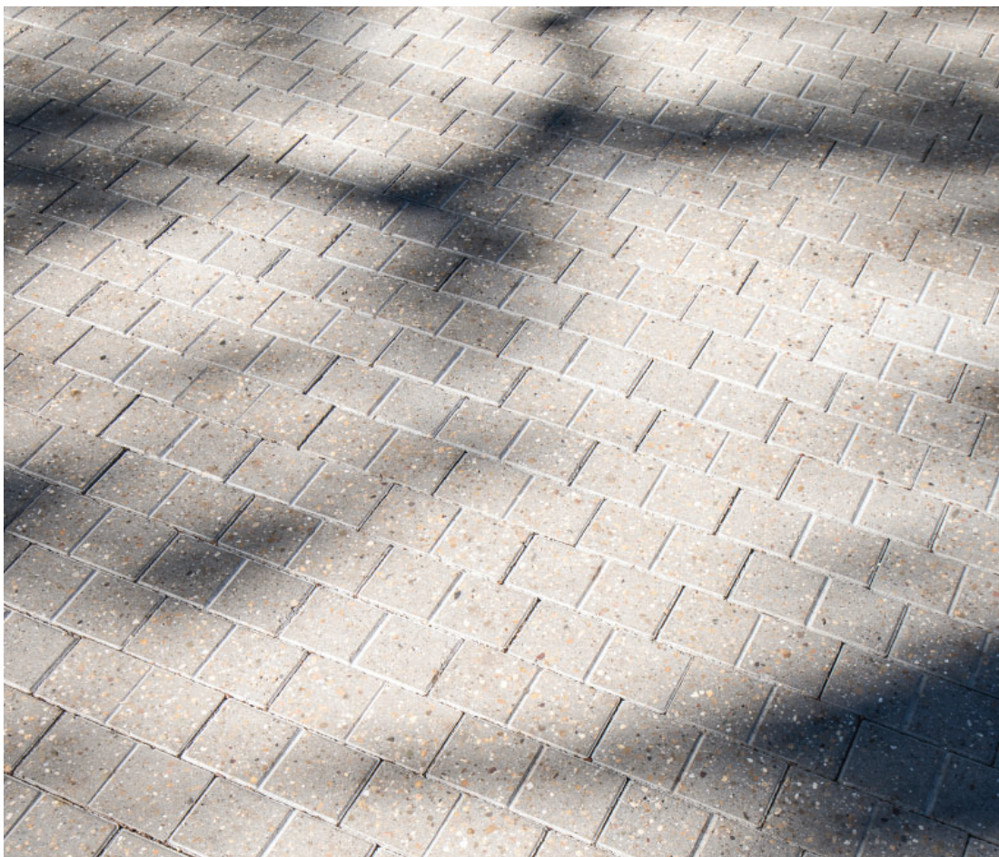
Traffic able unit paver to carpark